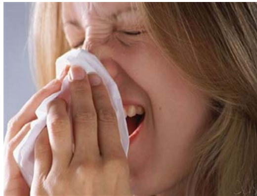
Minot Air Force Base

Since March the whole country has been working really hard to keep everyone safe from the Coronavirus, or COVID 19.